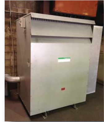
Mirus Lineator AUHF