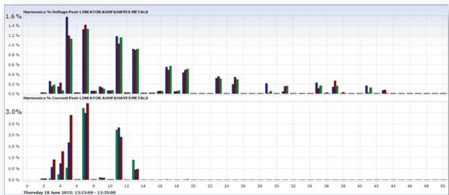
THD Voltage and Current spectrum after Lineator was installed.

To learn more about the Mirus Lineator and SOLV™ Software please visit mirusinternational.com